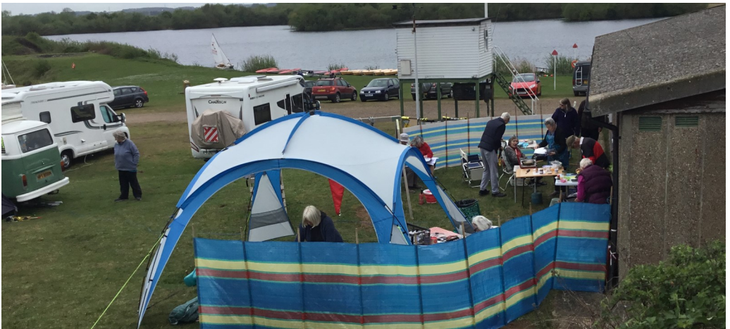
Cooking Competition in full swing at Girton AGM Weekend (DS)