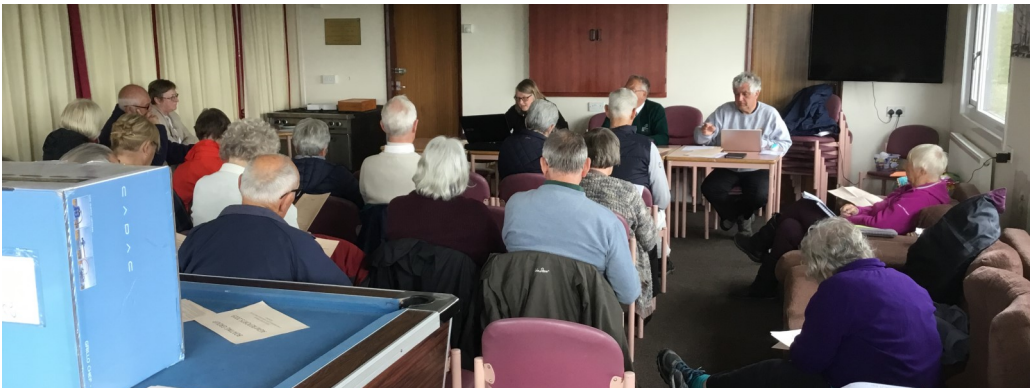
2019 AGM Girton Sailing Club