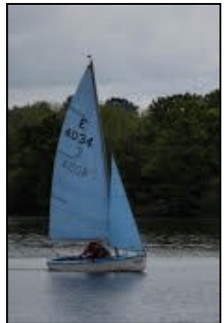
Enterprise at Bewl, 2016