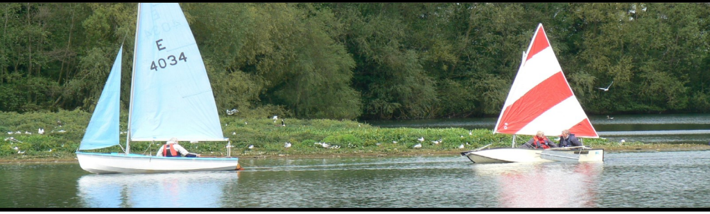
Paxton Lakes AGM and Meet

The meet was attended by 15 units who enjoyed reasonable if cool weather. A further 7 units stayed at the nearby Club site and another unit on a nearby certificated site. Conditions allowed sailing during most days although Sunday being blustery was left to the Sailing Club members.