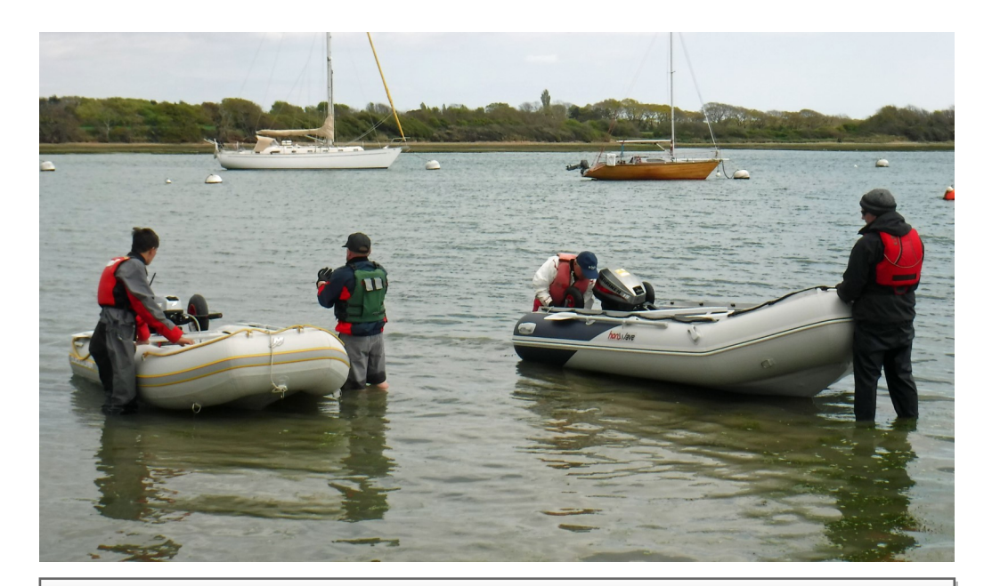
Launching at Cobnor - Easter Weekend 2017 (MW)