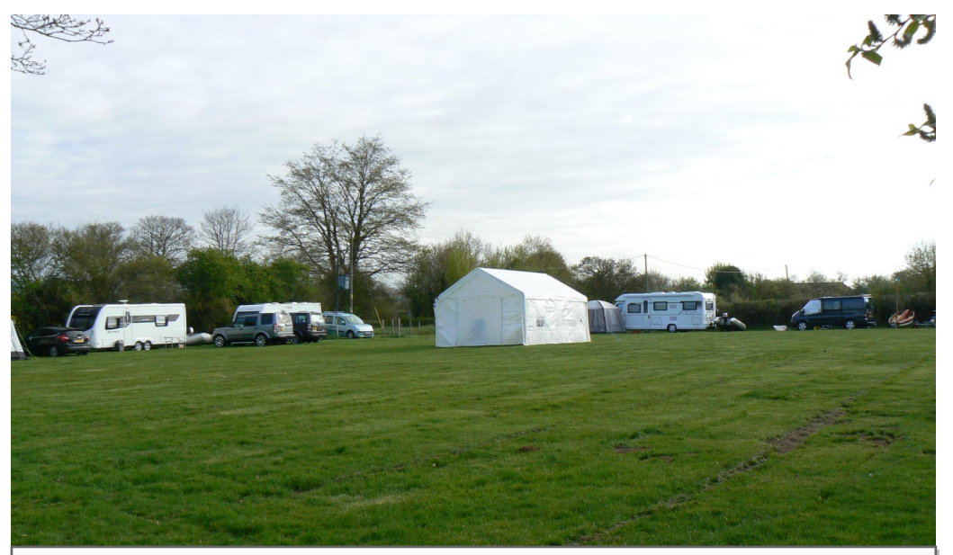
Cobnor Site - Easter Weekend 2017 (NP)