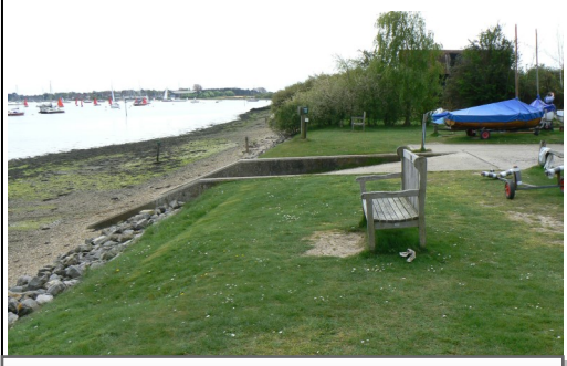
Launching is by hand only, although there is an electric winch for use on the ramp (NP) (See meet entry for permissive craft)

The site is located in part of the private Cobnor Estate on the shores of Chichester Harbour, a good size level field, sheltered from wind provides an ideal venue for camping and boating enthusiasts.