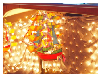
Tall Ships Sailing on a Sea of Lights (JB)

This year 6 units (10 members) attended the NFOL at Hickstead (2 units having dropped out due to unfortunate circumstances). The NFOL is another event where we have the Boating Group Reputation "for putting on a fantastic display "to defend.