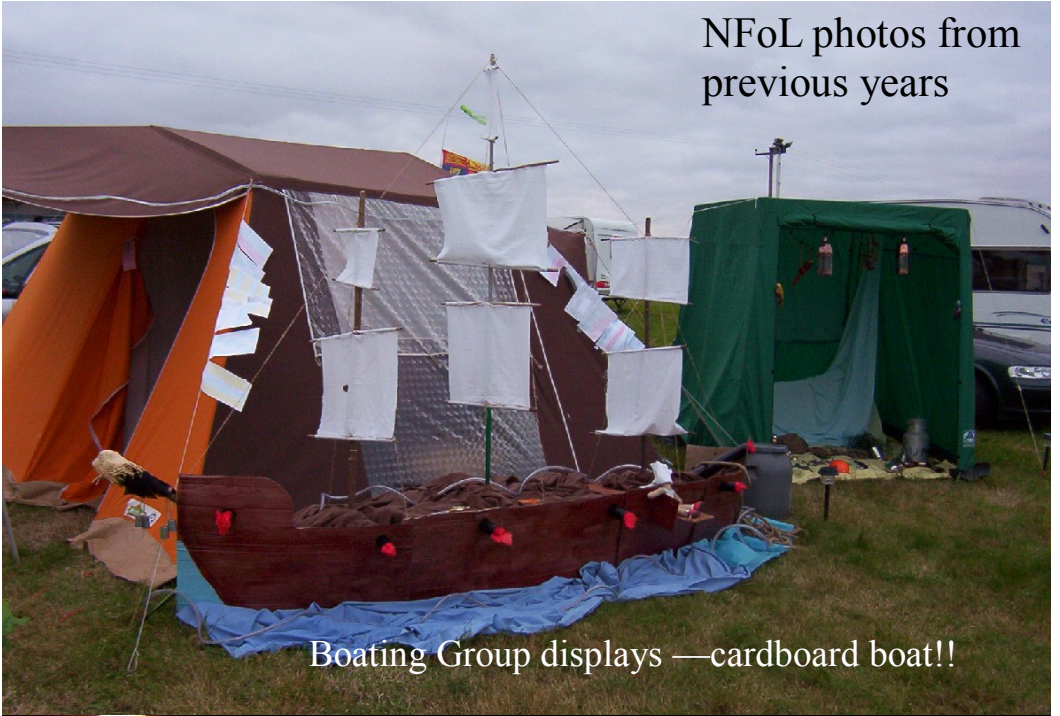
Boating Group displays —cardboard boat!!