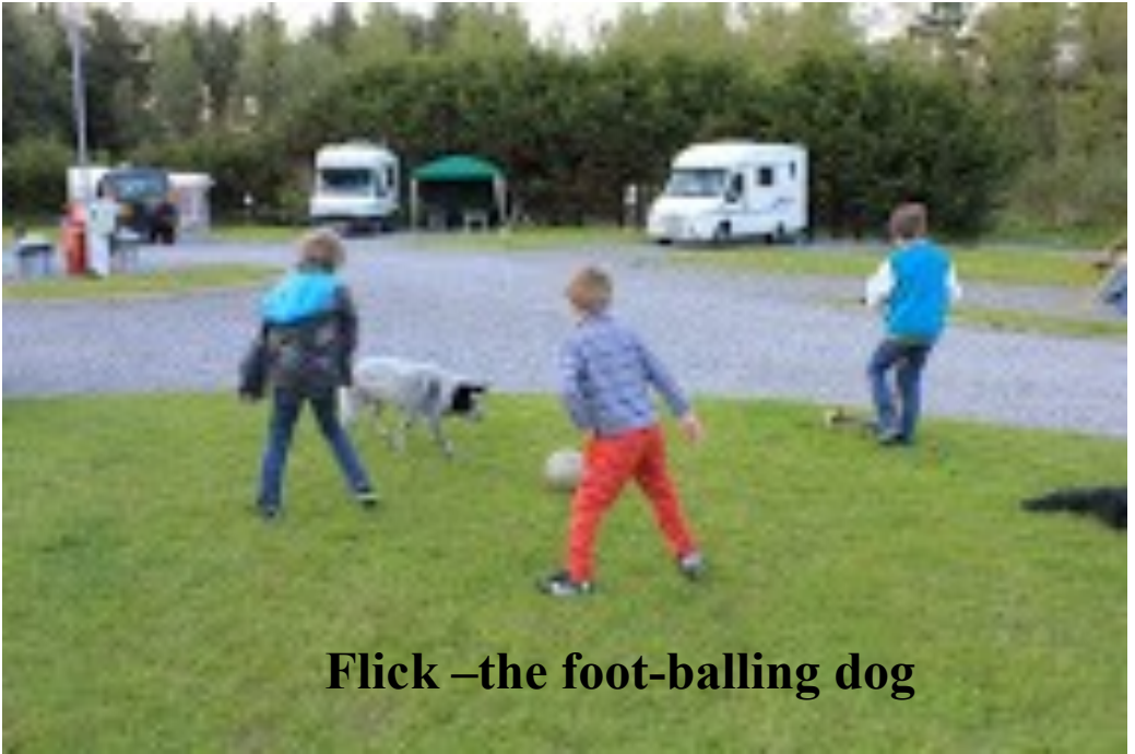
Flick –the foot-balling dog