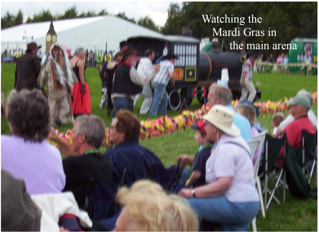
Watching the Mardi Gras in the main arena